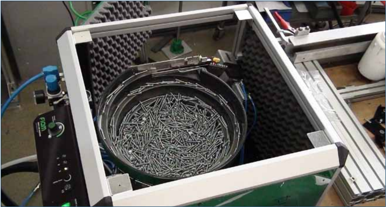
Bowl feeder cup with 420 mm diameter.

We designed and manufactured a dedicated MCA module with a special bowl feeder featuring 420 mm diameter cup, able to feed 37 mm long screws.