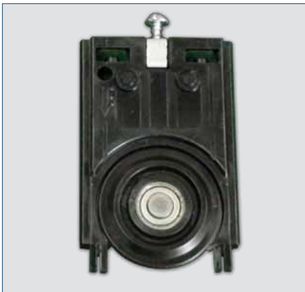
Bearings for sliding door wardrobes.